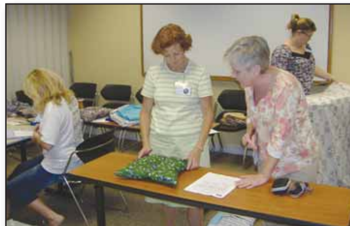
◦ A big thank you to United Way Day of Caring volunteers who sewed butterfly pillows for patients as their Day of Caring project on September 10.

We are looking for volunteers in Henderson and Buncombe counties and we would love to talk with you about the many volunteer opportunities you can begin to help us with now. If you are interested in learning more please give us a call at 692-6178.