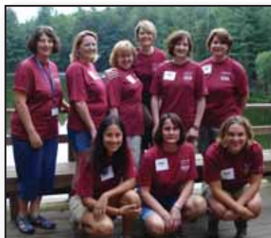
◦ Twenty campers along with a group of dedicated volunteers participated in Camp Heart Song's sixth season.

German shepherd, and Bandit, a cuddly French lop eared rabbit were in their fourth season at camp. Wolfy, a striking Alaskan Malamute mix came for the first time.