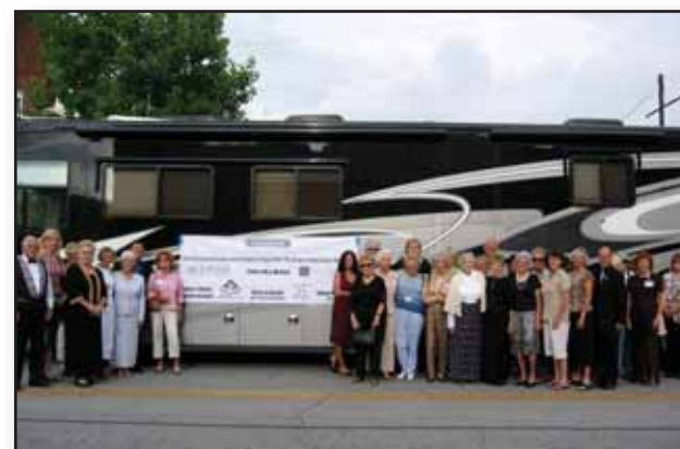
◦ Staff and volunteers gather to reveal the newly re-designed Hospice Home Store.